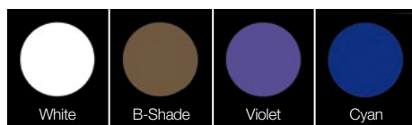
Under natural light conditions

LITE ART paste stains have a fluorescence quite similar to natural teeth. Their natural effect persists even under artificial light conditions.