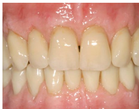
Upper teeth 13-23 and the gingiva are individualised with LITE ART and Ceramage