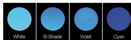
Even dark colours show vital and natural reflections under ultraviolet light