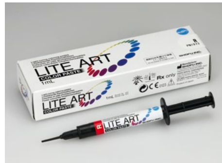
PN 1971 - 1985