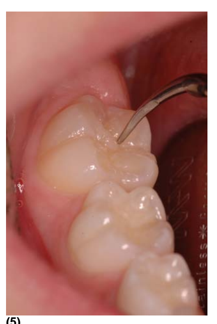
Of course, thorough cleaning of the tooth surface to be sealed – which may include the removal of deposits from pits and fissures, e.g. with the aid of an ultrasonic tip – is indispensable to optimal adhesion of the composite sealant.