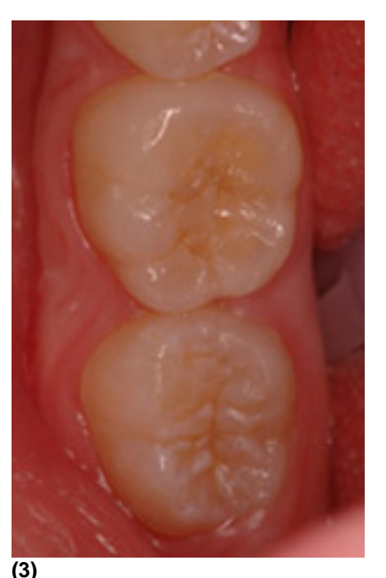
Thanks to its optimised viscosity and special filler load, this composite sealant offers durable and reliable results when used for conventional (right) and extended (left) fissure sealing.