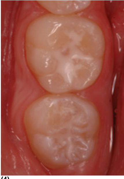
The composite sealant is accurately applied to fissures using the ultra-fine needle tip. This sealant can even be used on patients, or teeth, with an increased caries risk, since the S-PRG filler particles continually recharge fluoride ions from the oral environment and release them to the tooth structure, ensuring sustained remineralisation (see article for details).